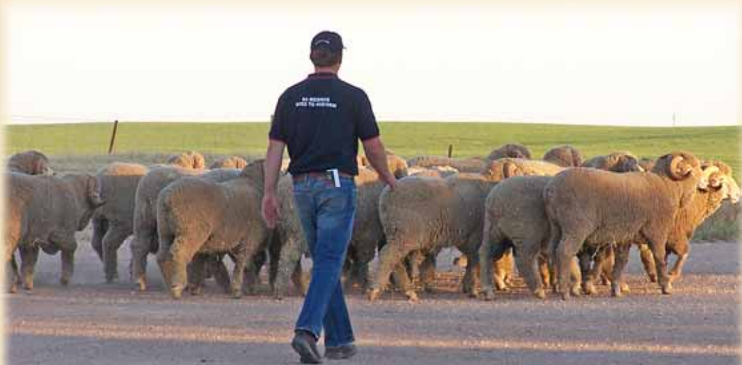
Some of the Sale Rams after our Ram Sale at our Eyre Park property

We have been extremely pleased at the way our sheep have performed at Minnipa in the last 2 years. The country is very strong limestone medic clover country and the growth and maturity in our young sheep in two extremely dry feed years has been most impressive.