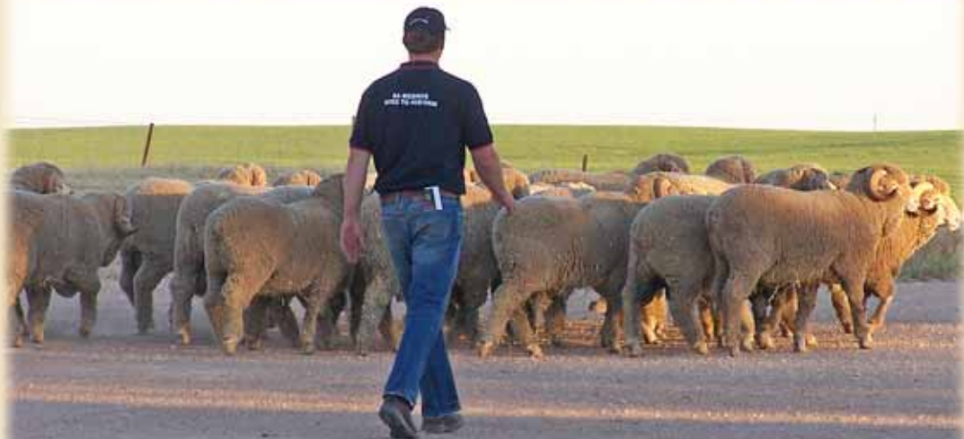
Some of the Sale Rams after our Ram Sale at our Eyre Park property

We have been extremely pleased at the way our sheep have performed at Minnipa in the last 2 years. The country is very strong limestone medic clover country and the growth and maturity in our young sheep in two extremely dry feed years has been most impressive.