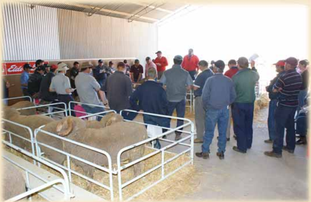
Ram Sale at our Eyre Park Property 2008

We will still only be a phone call away!