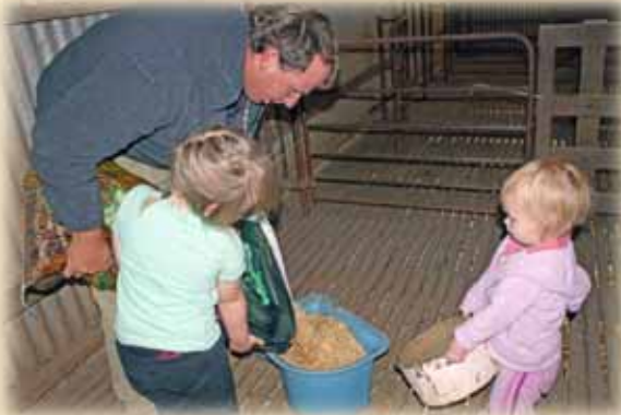
Future generation showing an intrest at a very young age!

Of course the move will also help facilitate the transition of Stud management to the next generation. We will also be closer to two of our Granddaughters!!!